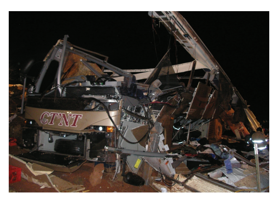
FIGURE 2-1 The fourth tour bus after a 360-degree roll 41 feet down an embankment.