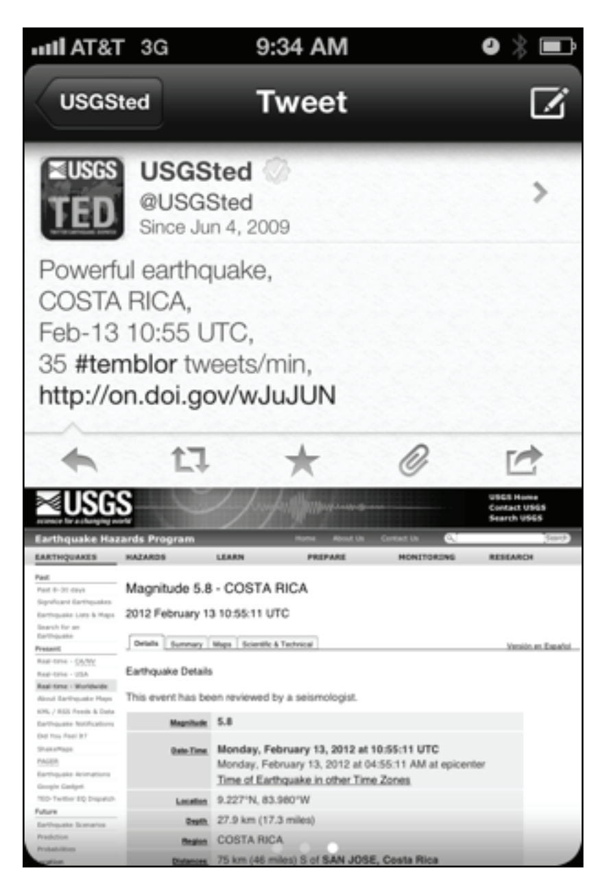
FIGURE 2.1 An example of a tweet and the associated Web page for a detected earthquake.

18 PUBLIC RESPONSE TO ALERTS AND WARNINGS USING SOCIAL MEDIA